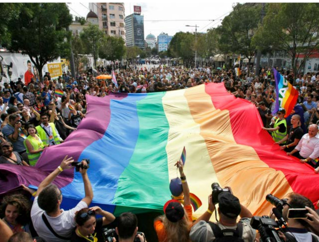
Foto e bërë nga Beta; marrur nga artikulli i Balkan Insight Third Belgrade Pride Parade Passed Without Incidents”

heterosexual women were also very visible in public.